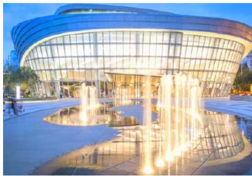
Shanghai International Dance Center