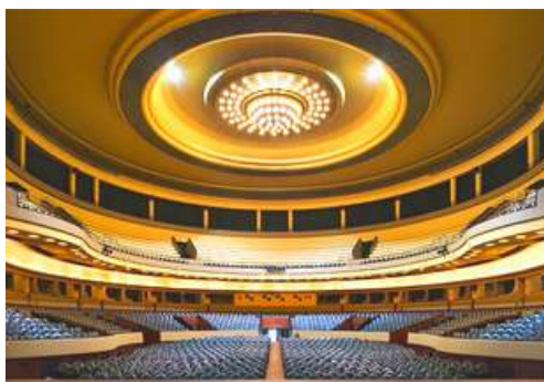
Coliseo de Oporto