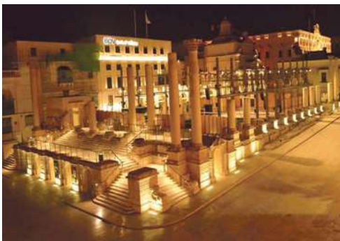
Royal Opera of Malta