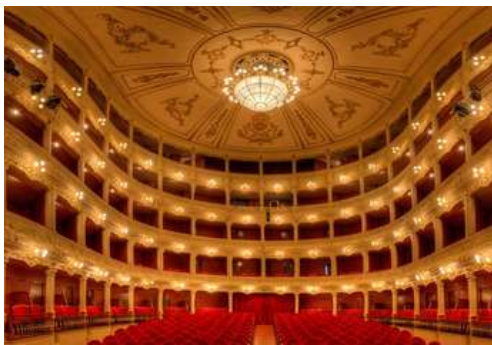
Main Theater of Mahon