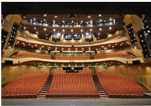
Sori Arts Center-Corea del Sur