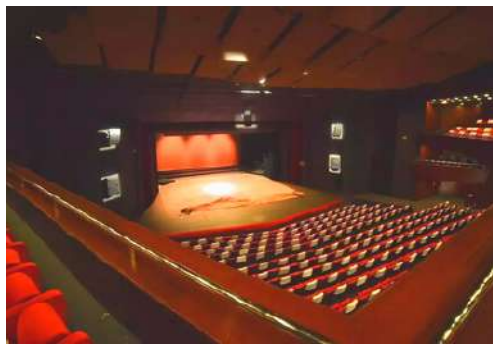
National Theater of Serbia