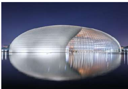
National Theater of China