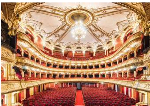
Cluj-Napoca National Opera