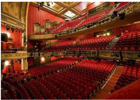
Los Angeles-Alex Theater